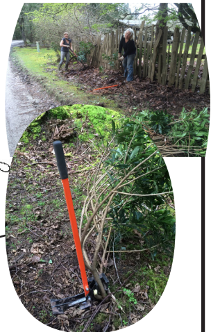
Daphne Laurel Spurge Purge