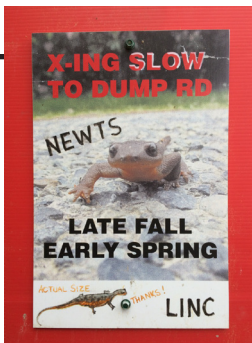
Newt Crossing Signs