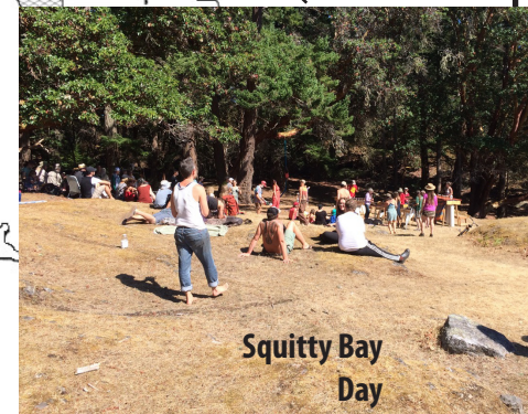
Squitty Bay Day