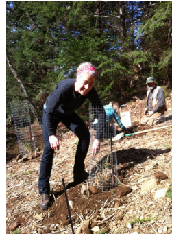
Islands Trust Fund Contract: Tree planting, Nest boxes, Access gate